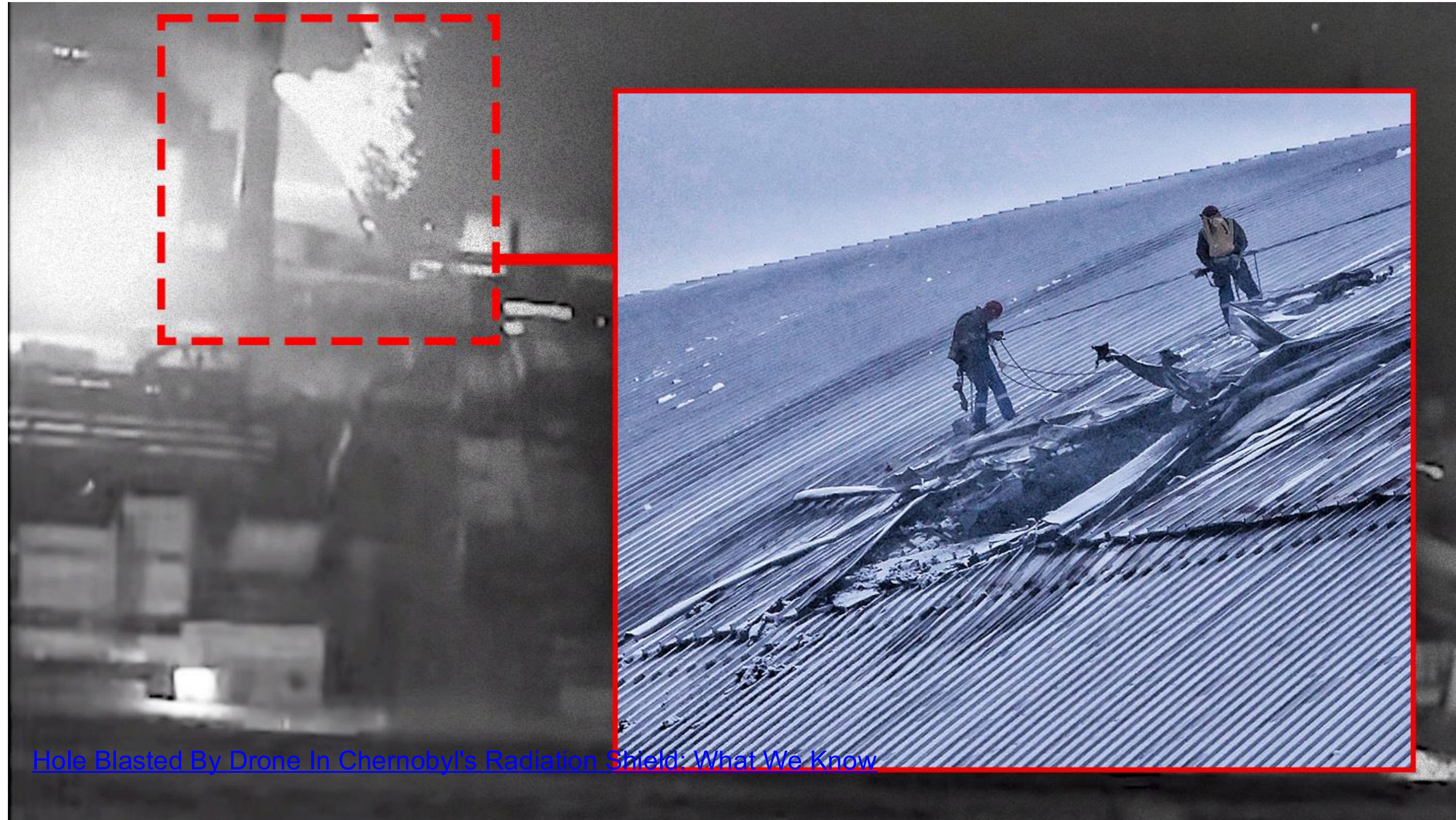
Hole Blasted By Drone In Chernobyl's Radiation Shield: What We Know