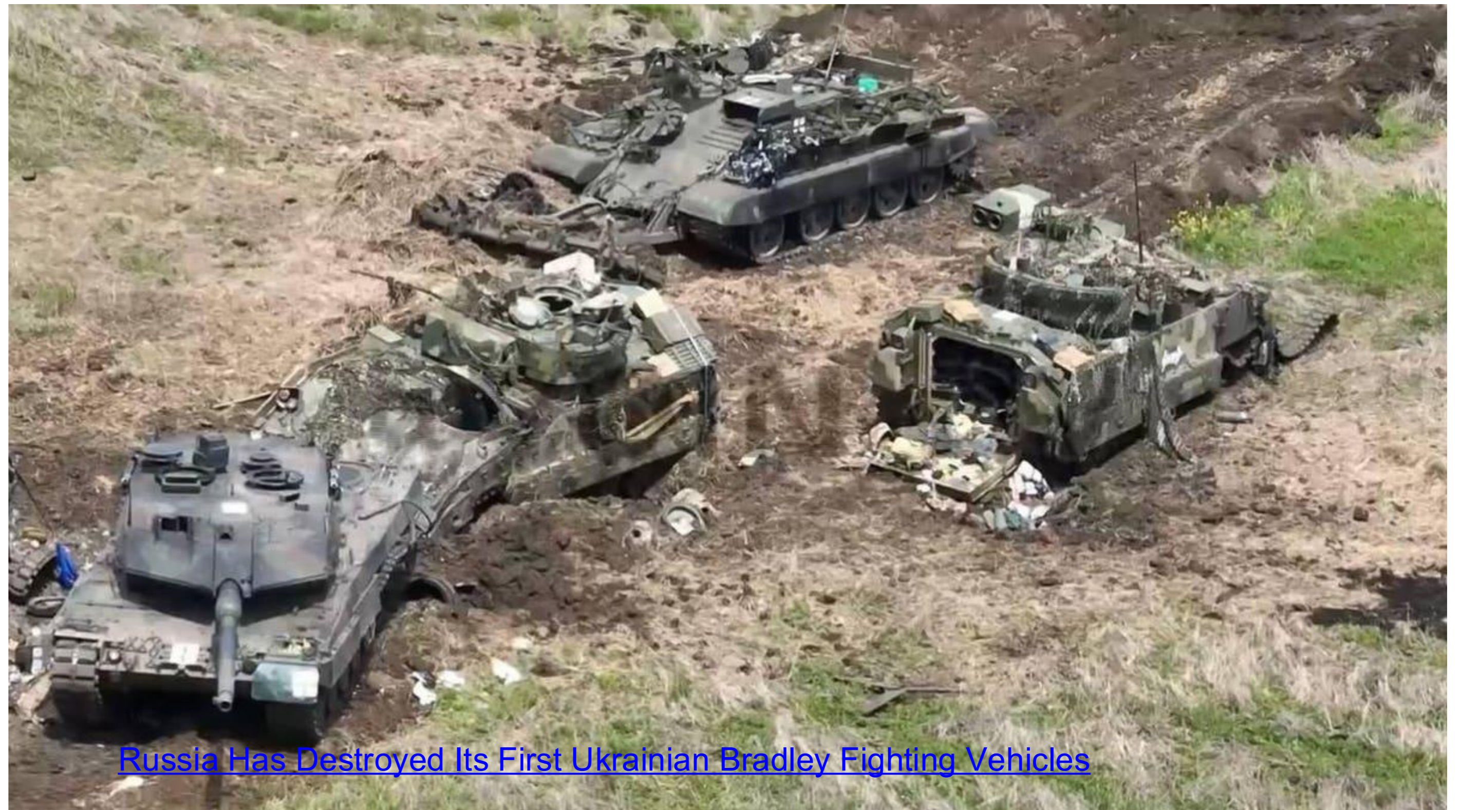
Russia Has Destroyed Its First Ukrainian Bradley Fighting Vehicles