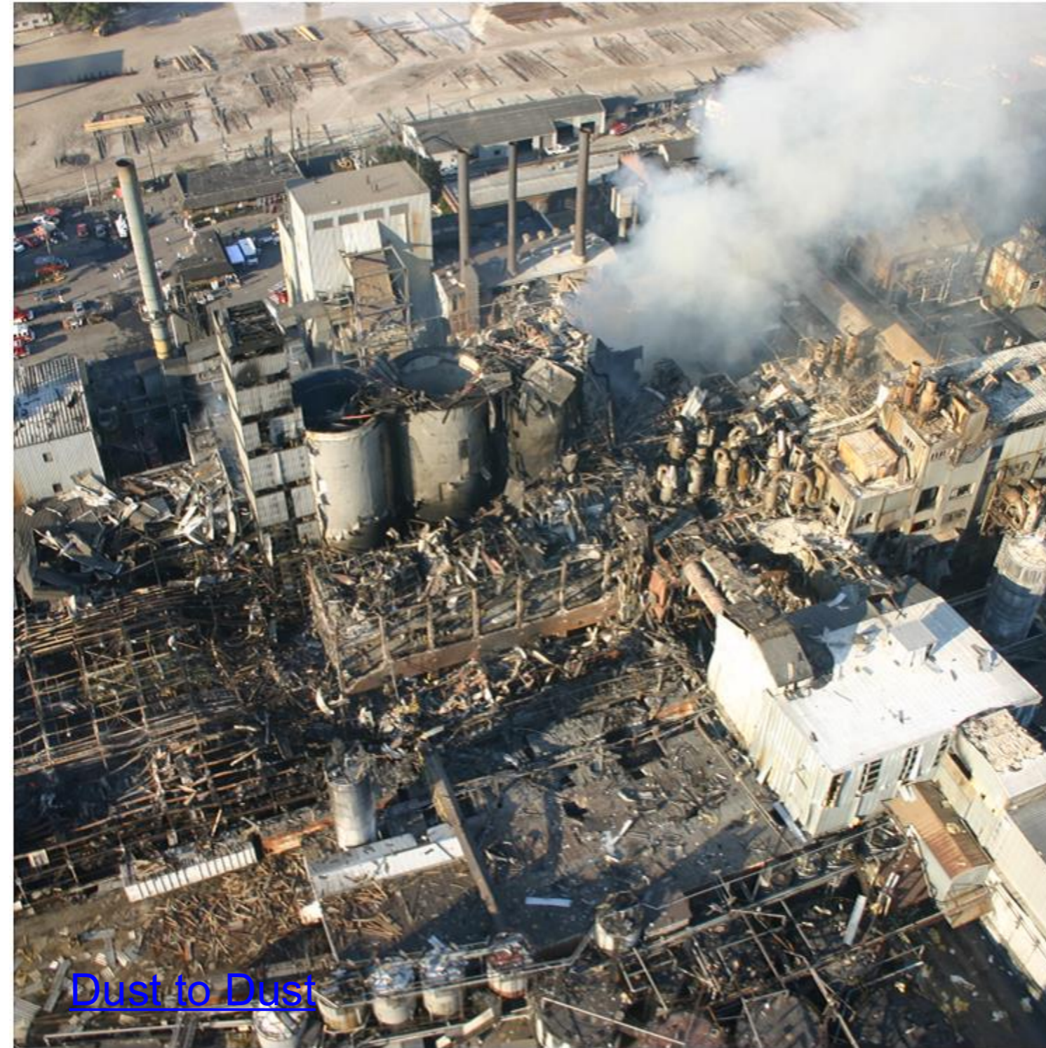
Dust to Dust