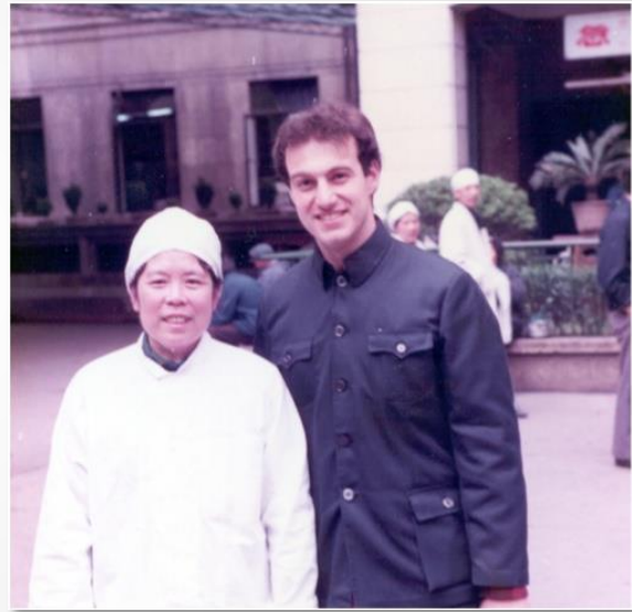
Shanghai Charity Hospital