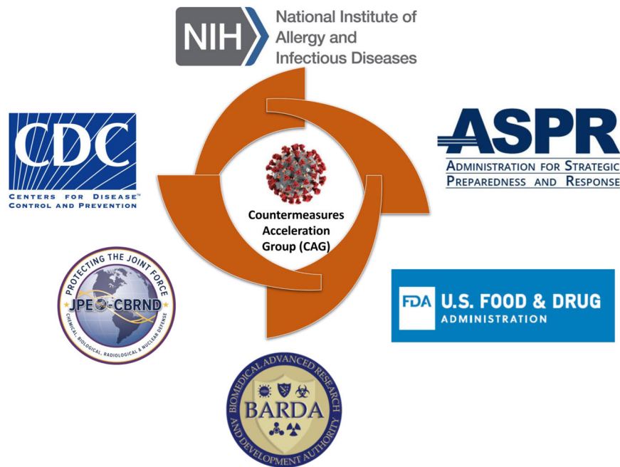
Fig. 2 Merging US government centers of excellence for COVID-19. The Countermeasures Acceleration Group, formerly known as Operation Warp Speed, is a partnership between the Departments of Health and Human Services (HHS) and Defense (DoD) with the mission to accelerate the development, manufacturing, and distribution of COVID-19 vaccines, therapeutics, and diagnostics.

including a vaccine regime with a germline-targeting prime with boost to induce broadly neutralizing antibodies against HIV (NCT05001373). In addition, an ongoing first-in-human study is evaluating whether delivery of soluble or membrane-bound HIV Env trimers via an mRNA platform is a promising platform for rapid and iterative HIV vaccine development (NCT05217641).